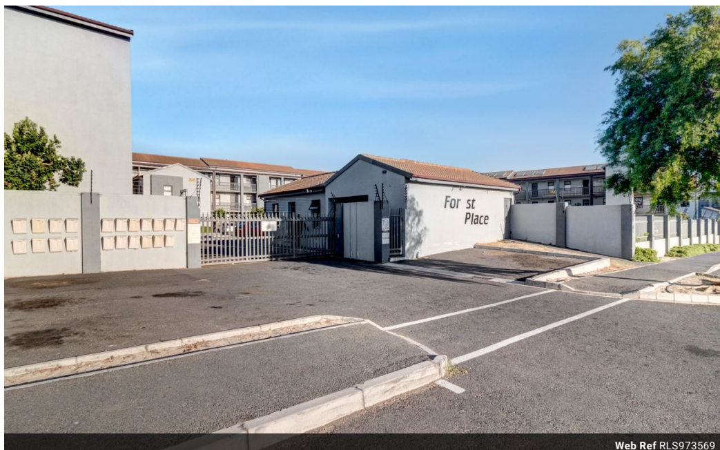
Web Ref RLS973569

Shop G01 Horizon Bay 4 Blaauwberg Service Road Table View Cape Town 7441