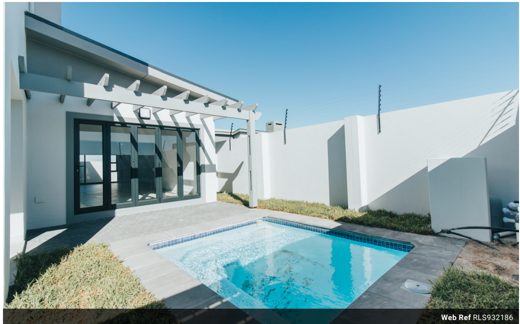
Web Ref RLS932186

Shop G01 Horizon Bay 4 Blaauwberg Service Road Table View Cape Town 7441