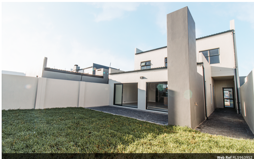
Web Ref RLS963952

Shop G01 Horizon Bay 4 Blaauwberg Service Road Table View Cape Town 7441