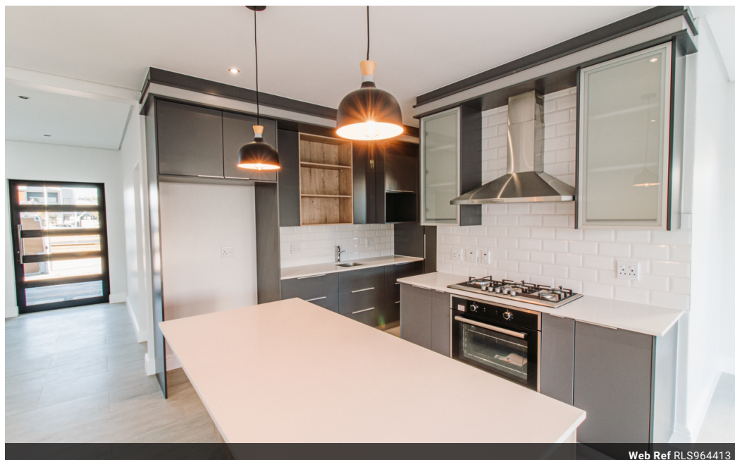
Web Ref RLS964413

Shop G01 Horizon Bay 4 Blaauwberg Service Road Table View Cape Town 7441