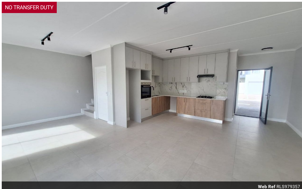
Web Ref RLS979357

Shop G01 Horizon Bay 4 Blaauwberg Service Road Table View Cape Town 7441