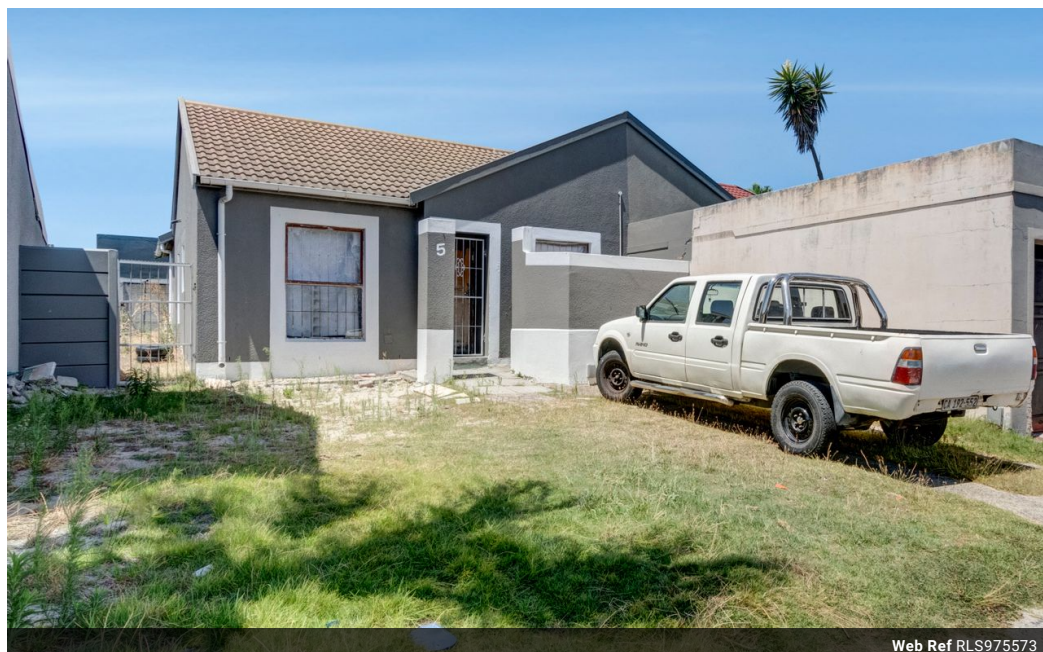
Web Ref RLS975573

Shop G01 Horizon Bay 4 Blaauwberg Service Road Table View Cape Town 7441