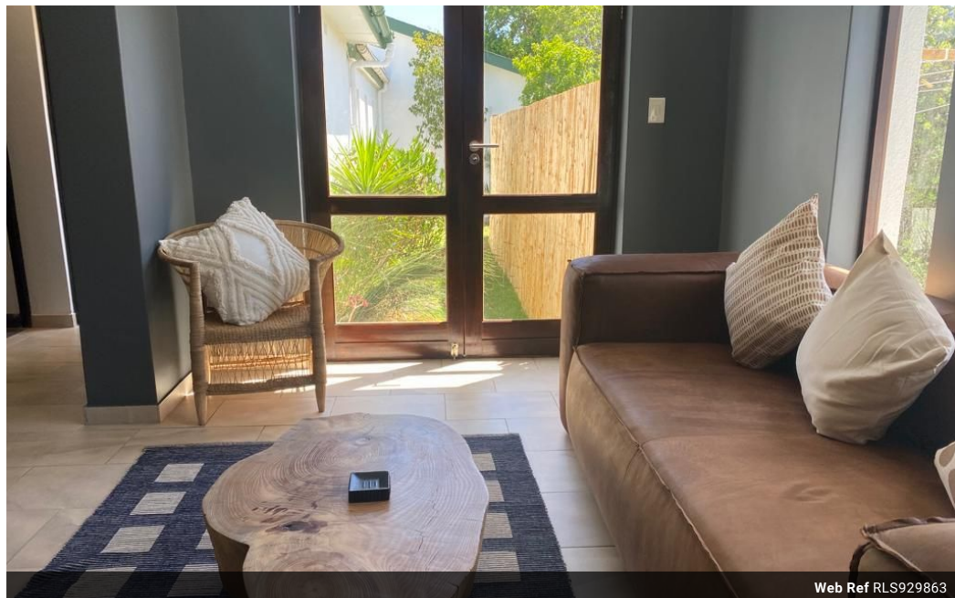
Web Ref RLS929863

Shop G01 Horizon Bay 4 Blaauwberg Service Road Table View Cape Town 7441