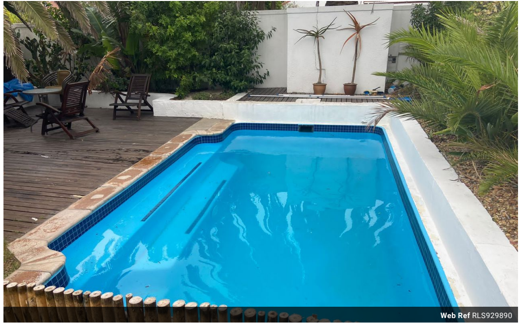
Web Ref RLS929890

Shop G01 Horizon Bay 4 Blaauwberg Service Road Table View Cape Town 7441