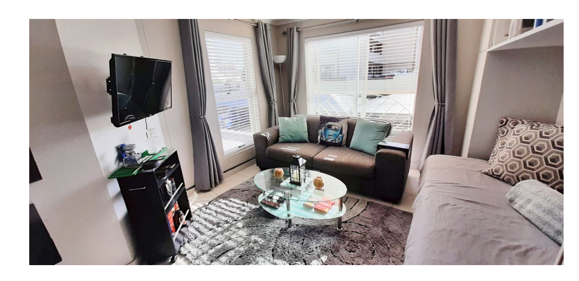
Web Ref RLS912569